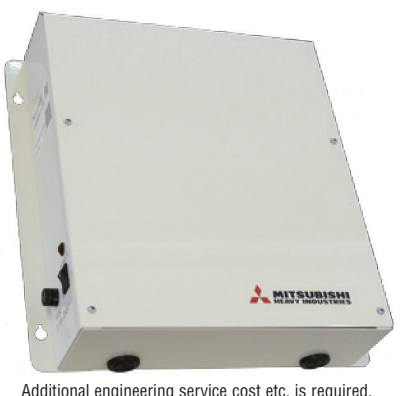
Additional engineering service cost etc. is required. Please consult your dealer when using this gateway.