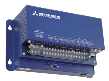
Additional engineering service cost etc. is required. Please consult your dealer when using this central control.

Also, SC-WBGW256 can be used as interface devices that convert Mitsubishi Heavy Industries Superlink-II communication data to BACnet code and are controlled centrally from a building management system.